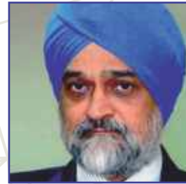
Montek Singh Ahluwalia Delhi Public School Mathura Road 1958 & Former Deputy Chairman, Planning Commission